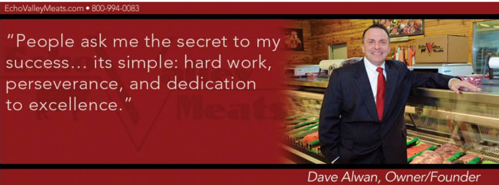
Social Media (Facebook)